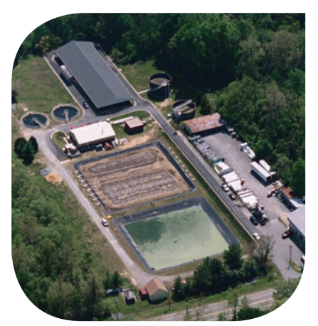
Biolac® Wave-0x™ Wave Oxidation Nutrient Removal Process

without recycle pumping • Alkalinity recovery • Single basin operation • Multiple