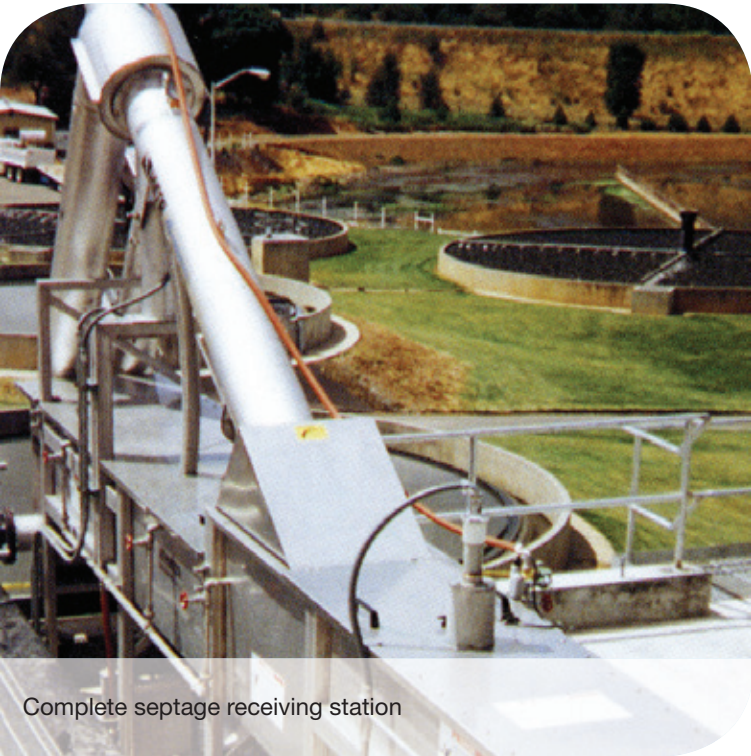
Complete septage receiving station