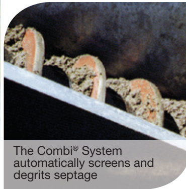
The Combi® System automatically screens and dewateres septage