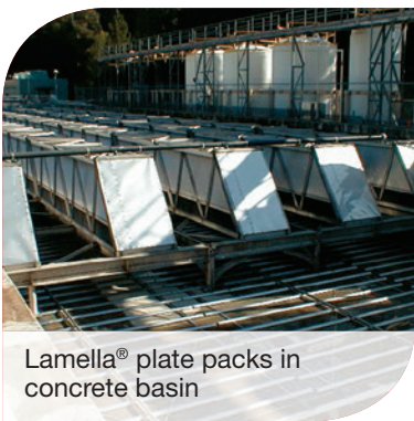
Lamella® plate packs in concrete basin

Both designs can be equipped with a flash mixing and flocculation tank upstream of the inlet pipe. The chemical flocculant is added in the separate flash mixing compartment.