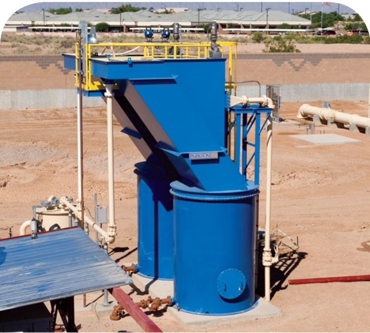
Lamella® Gravity Settler/Thickener