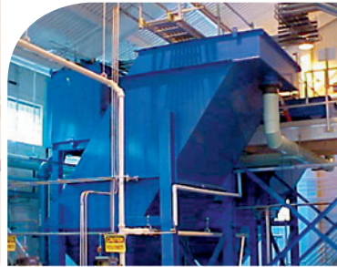
Lamella® Gravity Settler package unit